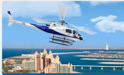
NATIONAL & INTERNATIONAL TOURS