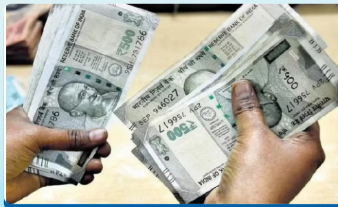
बैंक बैलेंस BANK BALANCE

दुनिया में जाने माने एक्सपर्ट्स का यह मानना है, कि उपरोक्त सभी चीजों की एक साथ प्राप्ती के लिए इस दुनिया में एक मात्र व्यवसाय है और वह है डायरेक्ट सेलिंग, हम सभी व्यवसाय को 21 वीं सदी की सबसे क्रांतिकारी तकनीक एमएलएम के साथ लायें है। आइये इस व्यवसाय को विस्तार से जानें और अपने सभी सपनों को साकार करें ।