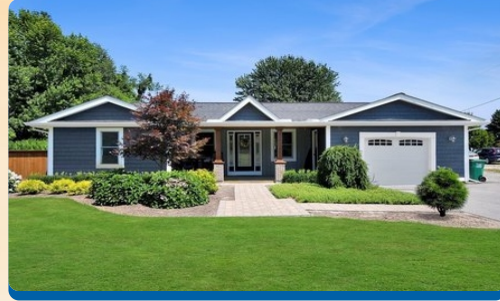
एक अच्छा घर A NICE HOME