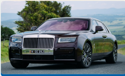
एक अच्छी गाड़ी A NICE CAR