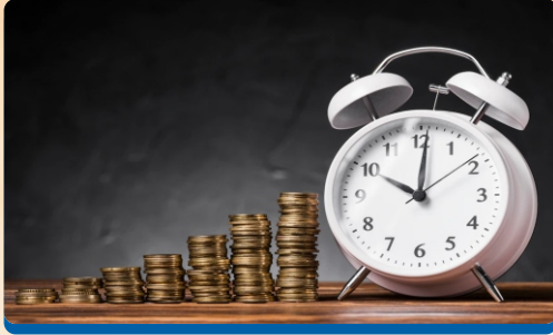
समय की आजादी FREEDOM OF TIME